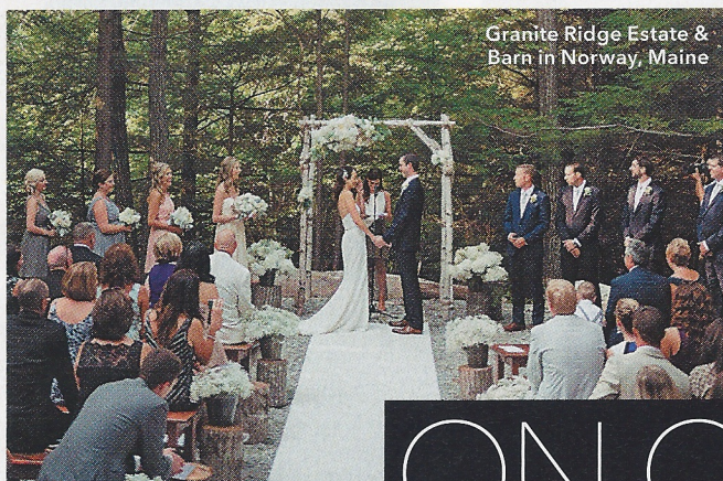
Granite Ridge Estate & Barn in Norway, Maine