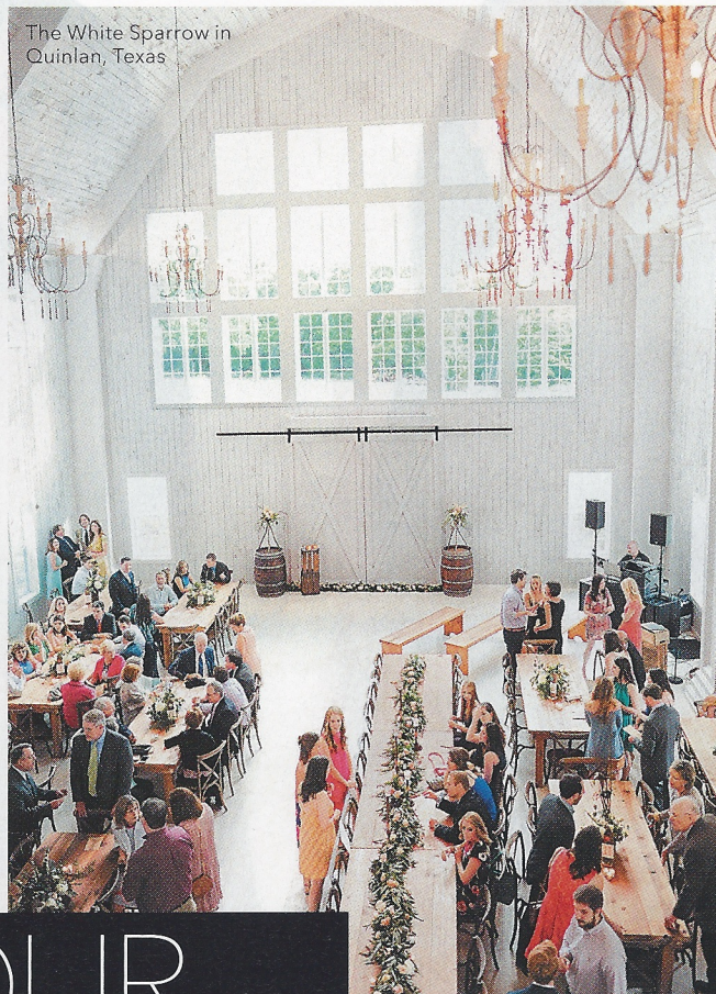
The White Sparrow in Quinlan, Texas