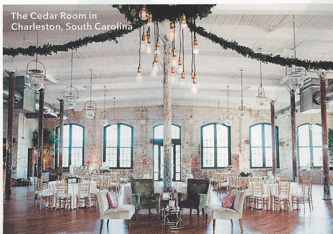
The Cedar Room in Charleston, South Carolina